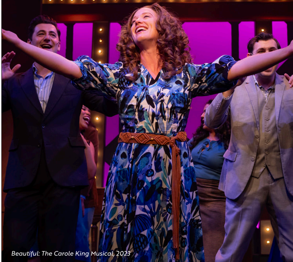
Beautiful: The Carole King Musical, 2023