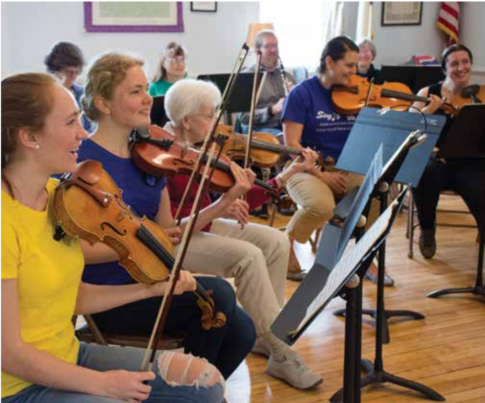
A sit-in orchestra gathers at the first annual Sing & Play Festival.