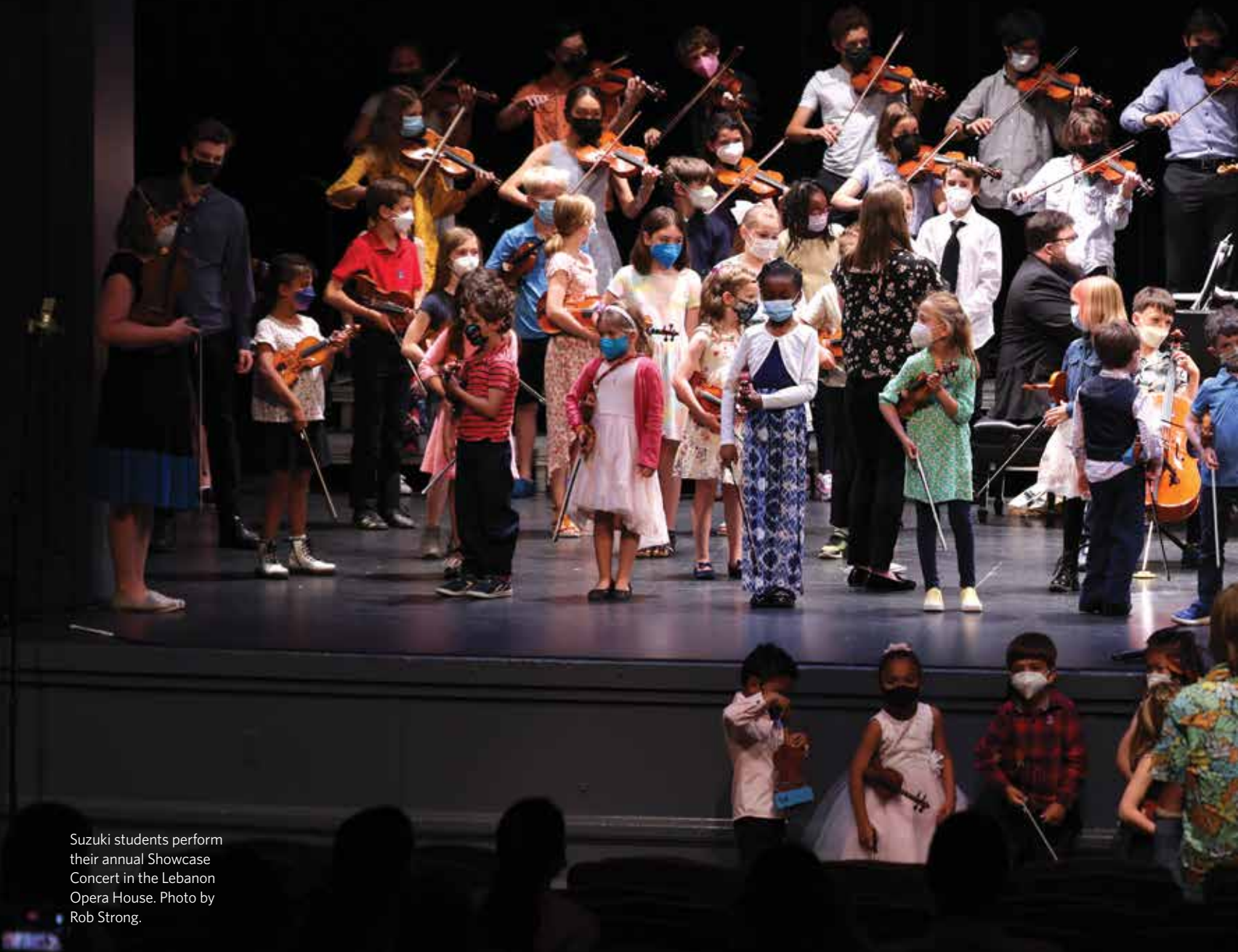
Suzuki students perform their annual Showcase Concert in the Lebanon Opera House.

BUILDING COMMUNITY BY MAKING AND SHARING MUSIC