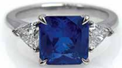
Above: Platinum radiant cut sapphire ring with kite-shaped brilliant cut diamonds.